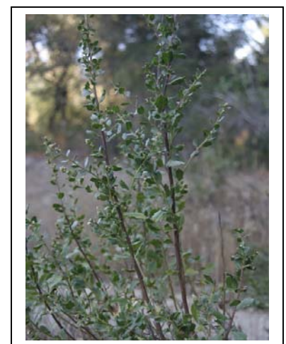
Coyote Brush ( Baccharis pilularis )