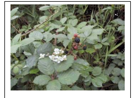
Himalayan Blackberry ( Rubus discolor )