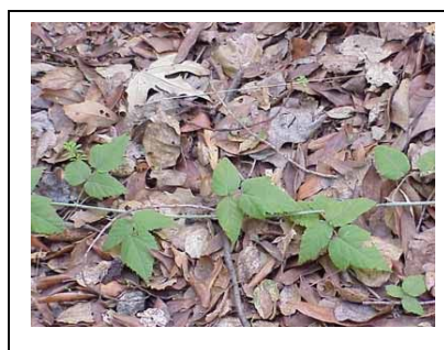
California Blackberry ( Rubus ursinus )