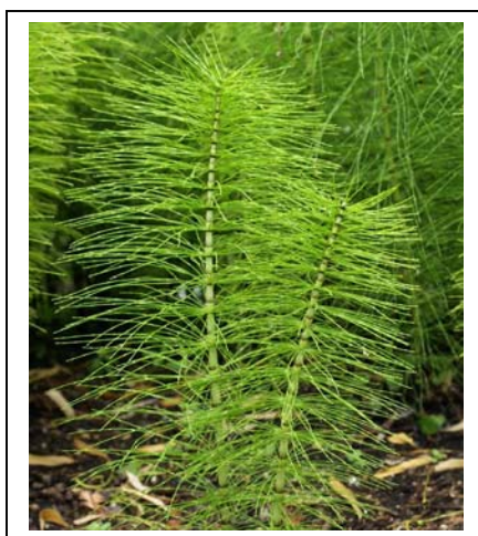
Horsetail ( Equisetum telmateia )