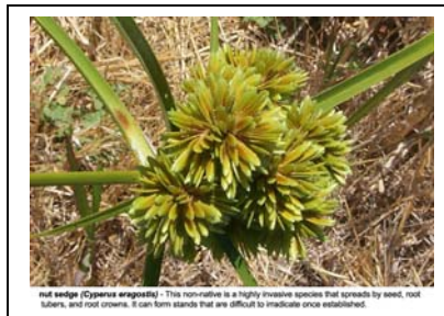
Nut Sedge ( Cyperus eragrostis )